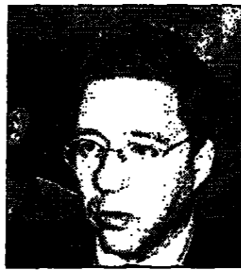
Yossi Beilin

Office criticized Beilin for meeting Jordanian leaders without coordinating the move with the government. The sources also charged Beilin, who is running for Labor's leadership, of going to Jordan as part of his primaries campaign. "I want to remind the Prime Minister's Office that I am not a civil servant or government worker. I am one of the opposition leaders and I will do everything in my power to move the peace process forward, because in my eyes there is no national interest of greater importance," Beilin said. Beilin and Hassan reportedly agreed that stopping the peace talks constitutes self-punishment, and punishes all those who want peace on both sides. Hassan reportedly told Beilin in the meeting that it was not the Jordanians who had canceled the events at Naharayim, but the